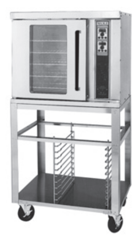
Model WKEHC1 shown with optional stand